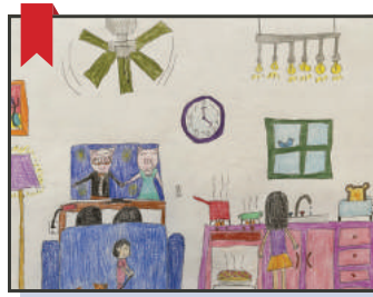
Second place: Olivia Chen, 9, of Ashburn